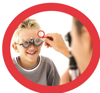
Vision Exams and Eyeglasses